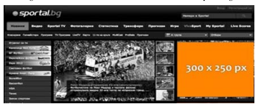
Figure 3. shows a banner advertisement published under the following conditions: